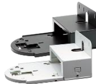
VC-WM12 PTZ Wall Mount