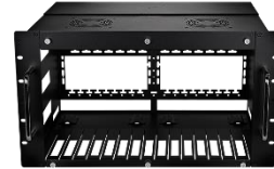
OIP-AC01 6U Rack-mount Chassis For AV over IP series